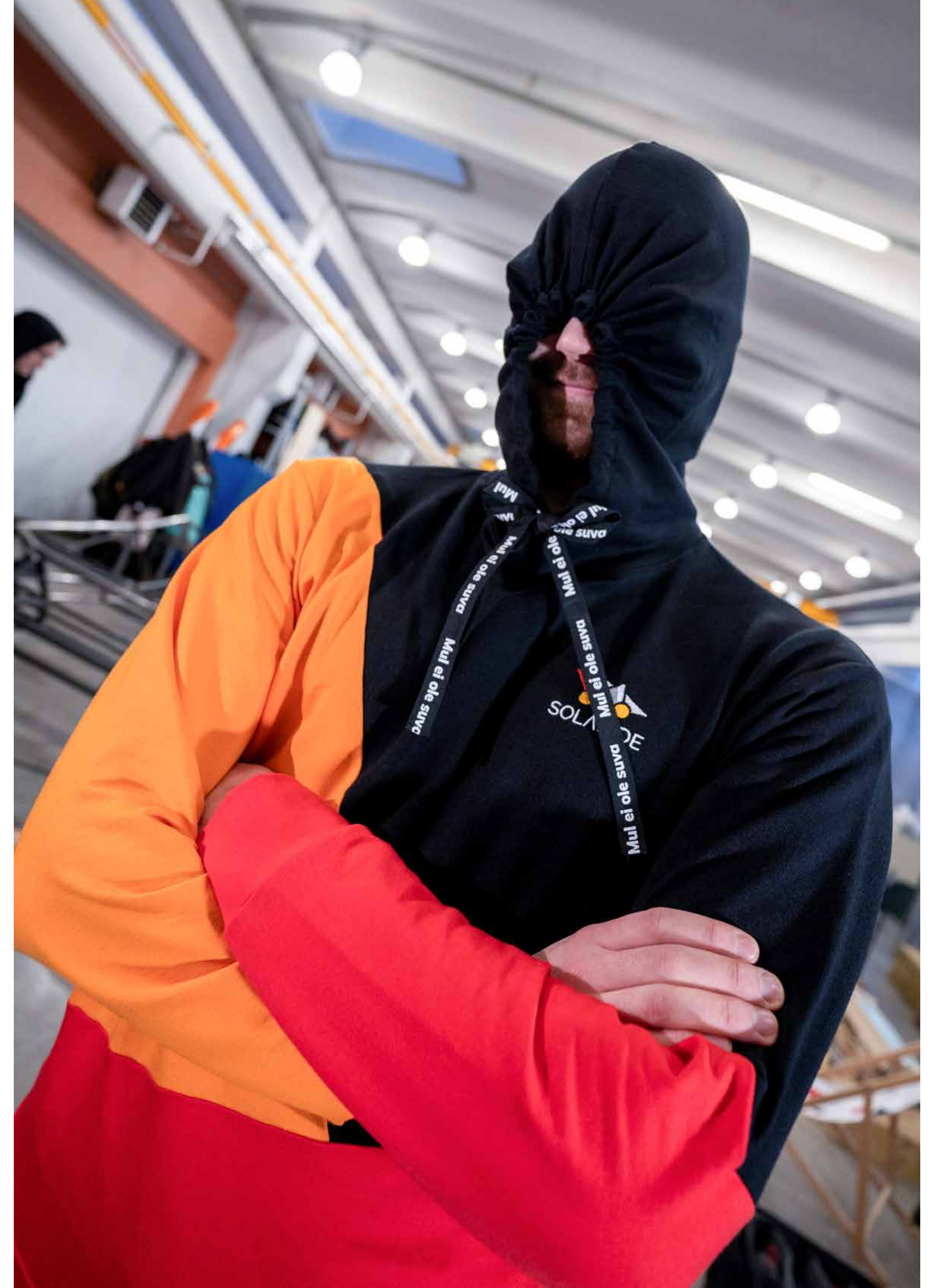
Solaride team member wearing our Tencel hoodie

Since there is no Planet B, we have chosen to produce most of our B2B products from Tencel™ - certified new-era fabric that is manufactured in Estonia. How cool is that!